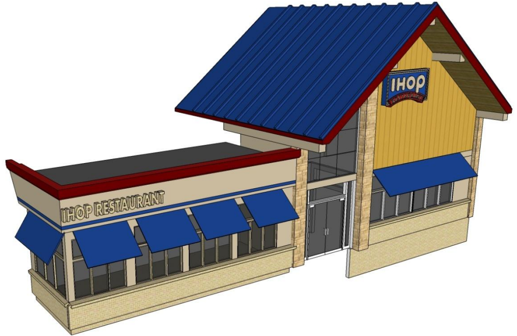
Concept of New Construction